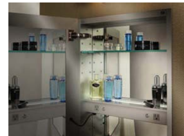
INTEGRAL LIGHT FEATURE