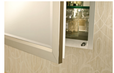
Side Mirror Kit SMK4-36 Order for Surface Mount

GLASSCRAFTERS, INC. 193 Veterans Blvd. Carlstadt, NJ 07072 1+ (800) 233-7362 (F) 1+ (888) 233-7362 sales@glasscraftersinc.com Products That Reflect Your Style